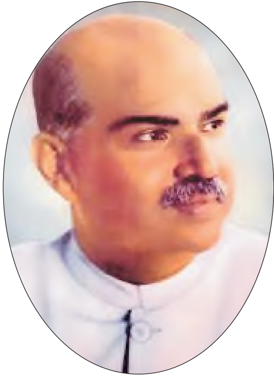
Dr. Syama Prasad Mookerjee