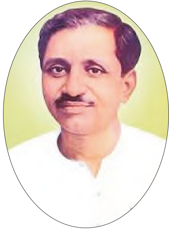
Pt. Deendayal Upadhyaya